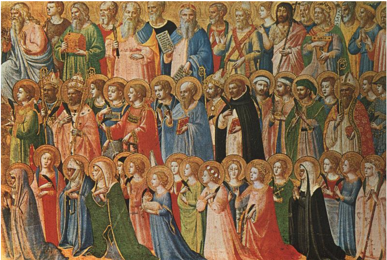
Fra Angelico (c.1395-1455) one of the panels from the predella of the Fiesole Altarpiece showing the Forerunners of Christ with Saints and Martyrs