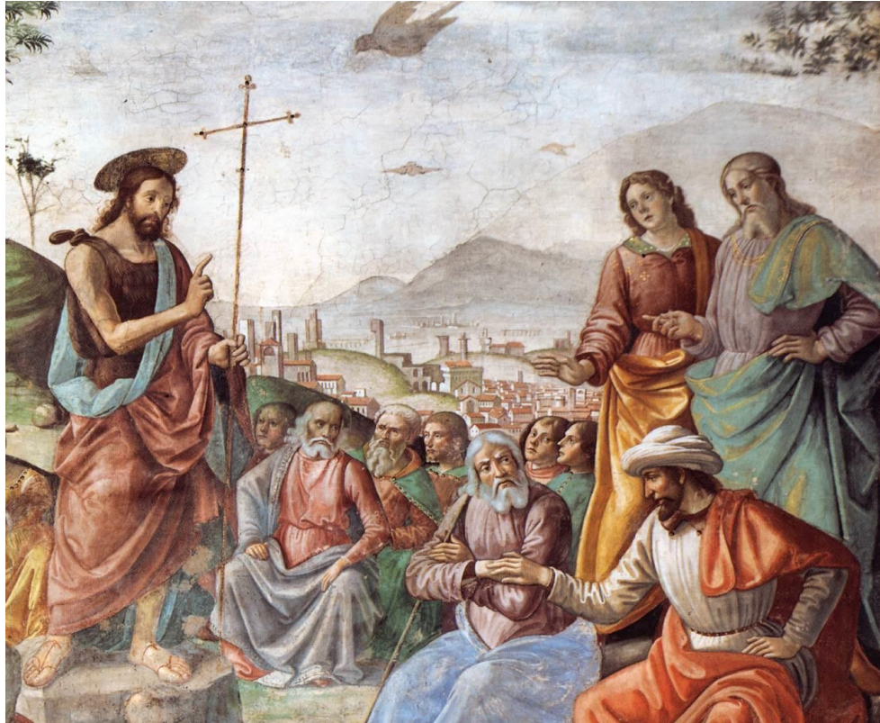
Domenico Ghirlandaio. Preaching of St John the Baptist