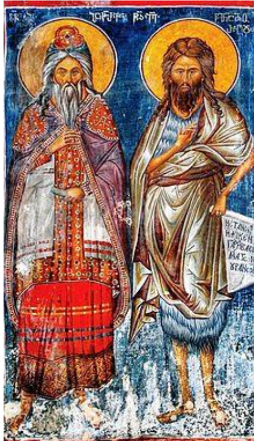
Zechariah and St John the Baptist A medieval Georgian fresco from Jerusalem.